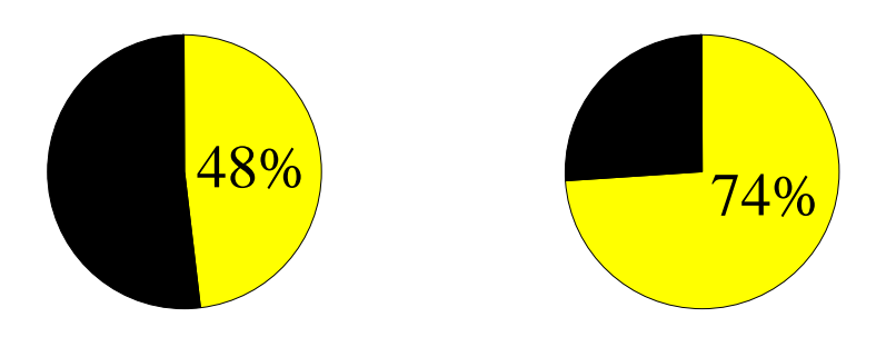
Figure 1. Percentage of RT delay explained by P3 delay. Left: No problem with response selection, P3 explains about one-half of the task difficulty. Right: There are additional problems with response selection. Nevertheless, P3 explains about three-fourth of the task difficulty.

My repeated meta-analyses of the published data (Kotchoubey, 1998, 2001; and the unpublished habilitation thesis at the University of Tübingen) demonstrated that this "impossible" option is, actually, the case (Fig. 1). Whenever a pLRP is observed, the P3 delay explains not a smaller (as predicted by the cognitive approach) but a larger portion of the response time, as compared with similar conditions without a pLRP. Moreover, pLRP is frequently recorded in the conditions in which all the RT delay is already explained by the P3 delay. This is the expected over-explanation. From the alternative viewpoint (as formulated, e.g., by Dewey more than 100 years ago), the paradox is easy to solve: stimulus evaluation and response selection are not two consecutive stages, but run in parallel within the sensorimotor coordination constituting a given RT task.